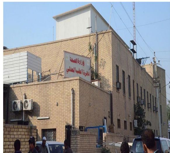
Fig. 1 Medico-Legal Directory (MLD) in Baghdad 2021

This descriptive record-based study with an analytic element examined the data on suicide from the digital archive of the coroner's office within the (MLD) serving the 8,780,422 population of Baghdad [8]. In a once-weekly scheduled visit from September 1 to December 1, 2021, the research team led by the primary author accessed the records of all suicide cases reported within the last 6 months of 2021. They chose hundred consecutive cases out of 104, excluding the four most short forms. The coronel responsible team finalizes every case's electronic report by combining the police and mortuary records with collateral history from the deceased's family. The primary factors for this study were sociodemographic data, the technique employed, and the attributed